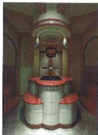
Right from the spa: Relax in the lounge chair, hydro bath in spa lounge chair Relax from the spa: The Spa lounge chair, treatment room, hot tub and spa bath

While fitness does play a role in the entire concept of wellness, the trainers at the Chateau incorporate just the right kind of exercise for each programme in order to achieve the best results. There is even a yoga specialist from North India on the staff.