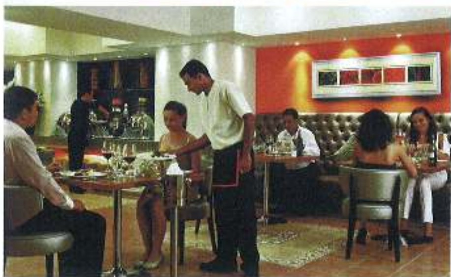
Left from the top: A la Carte, French Five Dining, offering exquisite gastronomic cuisine. La Vie offers delicious plus healthy foods from the top. Below: The Spa, a very unique concept, serving only afternoon tea. Organic produce comes from the resort's own farms.

Embracing organic wellness as a way of life, The Chateau is one of Malaysia's greenest resorts – both in location, and its operational practices. The Chateau has copyrighted the tagline "We have a heart for our planet" and has proceeded to find ways in delivering a luxurious wellness experience in the most ecologically sensitive way possible.