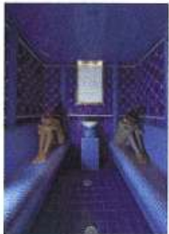
Clockwise: Start the day with yoga; modern rejuvenation; The Salt Grotto and the Aquaveda Bed

With clean, cool and fresh air, luscious flora and fauna and nutritious cuisine, La Sante is the ideal place to recharge and re-energise yourself. Whether you are planning a brief stopover between your meetings or a longer stay, La Sante welcomes you with warm open arms and is the best partner in your journey to health and wellness. ■