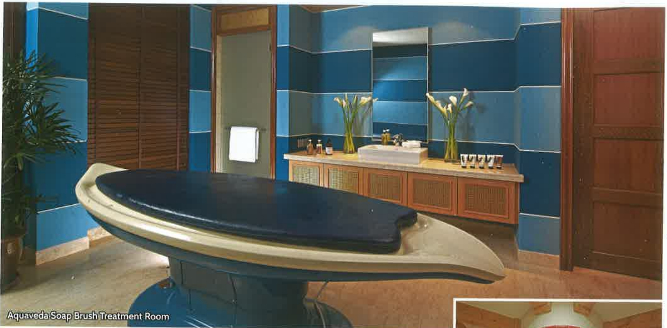
Aquaveda Soap Brush Treatment Room

If you're looking for a unique getaway just an hour's drive from KL, The Chateau Spa & Organic Wellness Resort should definitely be on your list. Modelled after a 12th-century "Haut Koenigsbourg" castle in Alsace, France, this award-winning resort stands at 3,000 feet above sea level and encompasses over 16,000 acres of lush greenery as it reigns over the French-themed village resort of Colmar Tropicale in Berjaya Hills, Pahang.